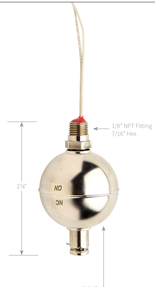
FLOAT: I 1" Dia Nom. x 1" Tall