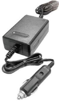
Size: 4.23in x 2.64in x 1.42in (107.5mm x 67mm x 36mm)