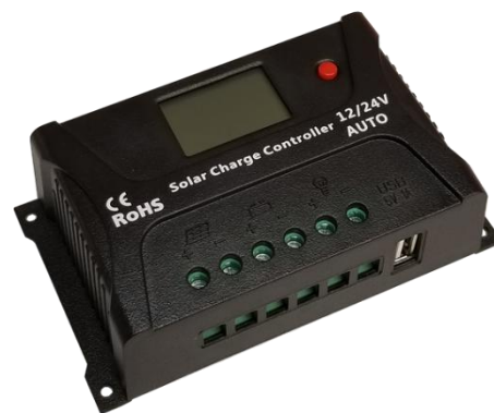
12V / 24V Intelligent Solar Charge Controller