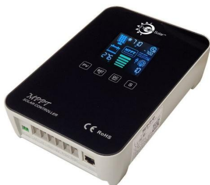
12V / 24V 30A MPPT Solar Charge Controller