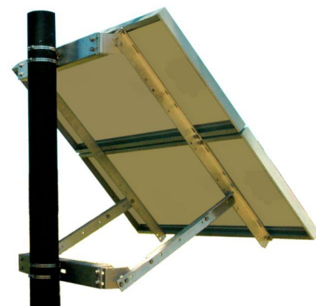
170W and 340W Kit Mount System