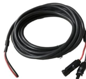
20' Outdoor Rated 12AWG Cable