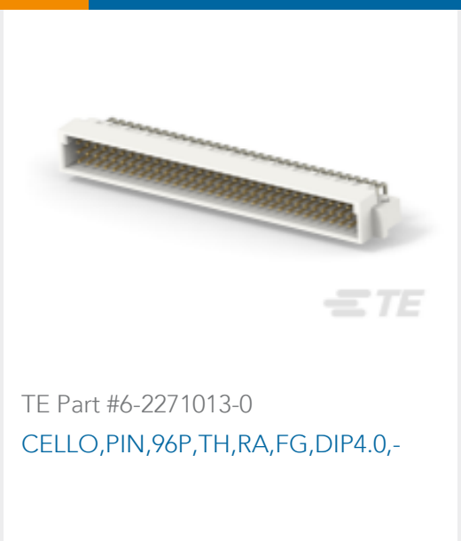
TE Part #6-2271013-0 CELLO,PIN,96P,TH,RA,FG,DIP4.0,-