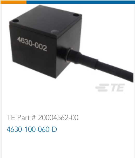
TE Part # 20004562-00 4630-100-060-D