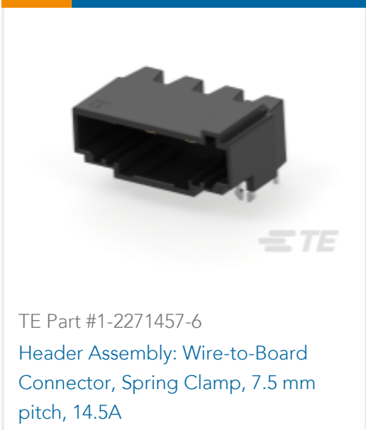
TE Part #1-2271457-6 Header Assembly: Wire-to-Board Connector, Spring Clamp, 7.5 mm pitch, 14.5A