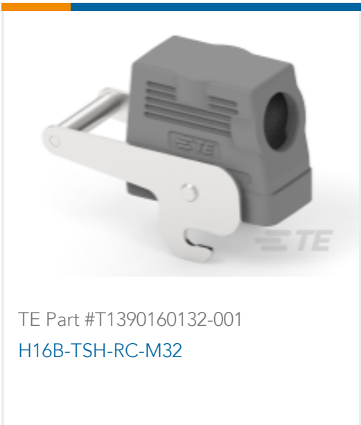
TE Part #T1390160132-001 H16B-TSH-RC-M32