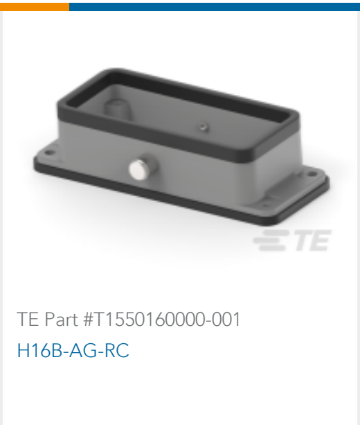
TE Part #T1550160000-001 H16B-AG-RC