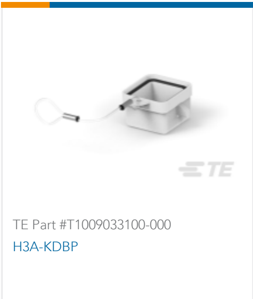
TE Part #T1009033100-000 H3A-KDBP