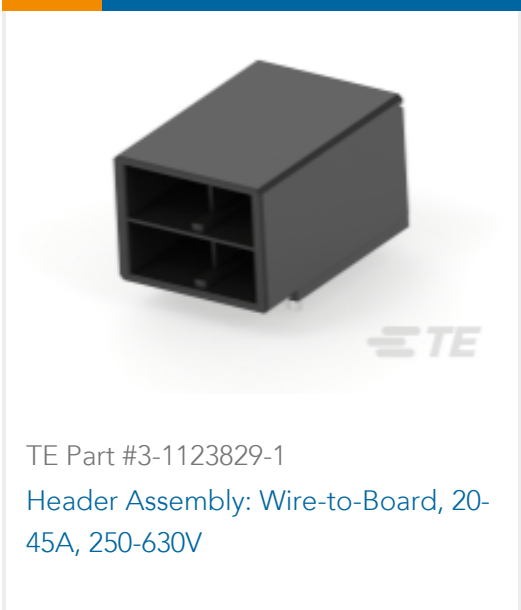
TE Part #3-1123829-1 Header Assembly: Wire-to-Board, 20-45A, 250-630V