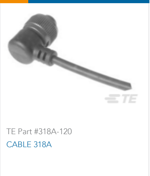
TE Part #318A-120 CABLE 318A