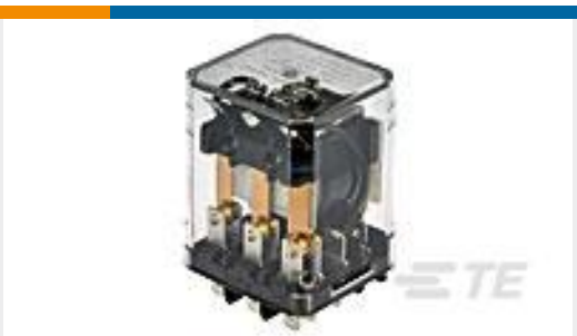
TE Part #1-1393118-4 KUP-14D15-24=KU-