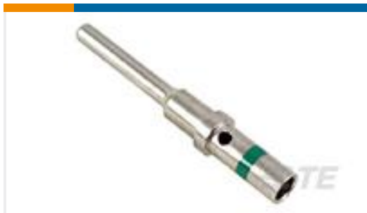
TE Part #0460-215-16141 PIN, SOLID, SIZE 16, 14AWG, NI