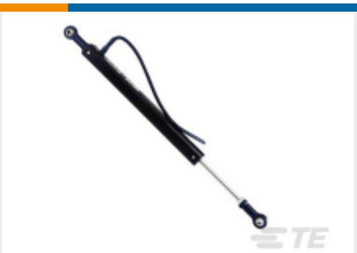
TE Part #CLP-150 LINEAR POT, IP65, 150MM RANGE