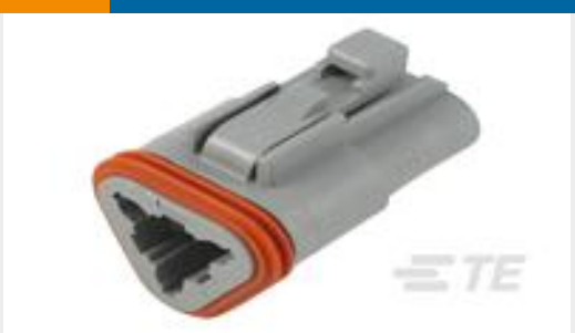
TE Part #DT06-3S PLG, 3P, GRY, N