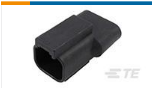
TE Part #DT04-2P-RT01 REC, 2P, BLK, 600V, 1.28V, 4A DIODE, NI