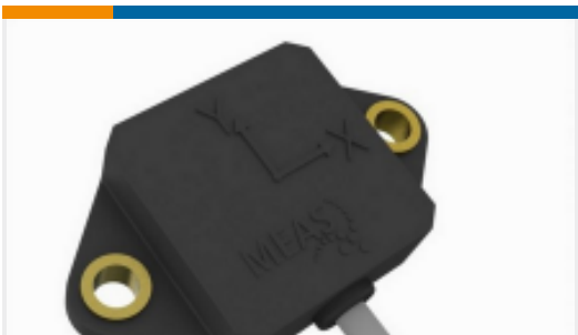
TE Part #G-NSDOG2-002 AXISENSE-2 V-OUT-45 TILT SENSOR FLOOR MT