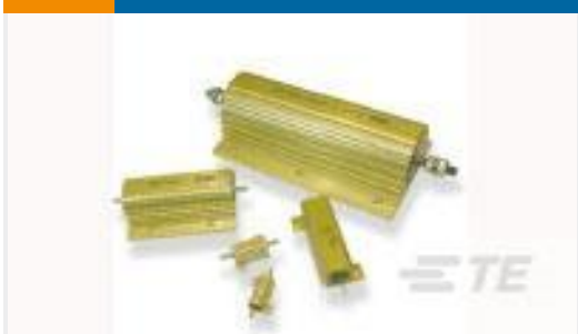
TE Part #3-1625999-2 HSC100 3R0 5%