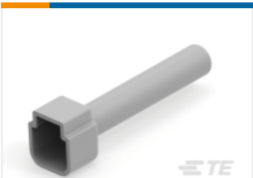
TE Part #DTM4S-BT BOOT, 4P, PLG, ST, GRY