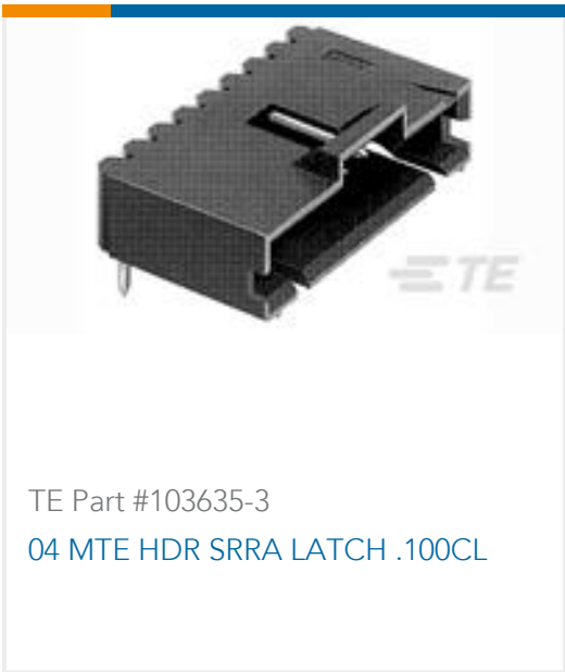
TE Part #103635-3 04 MTE HDR SRRA LATCH .100CL