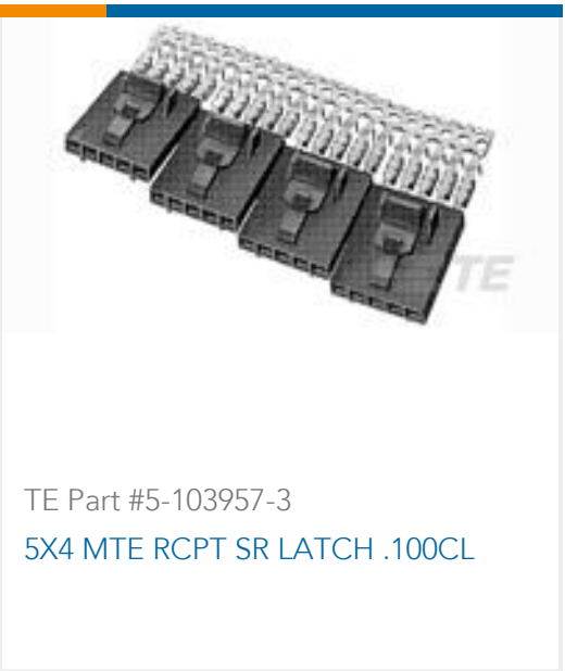
TE Part #5-103957-3 5X4 MTE RCPT SR LATCH .100CL