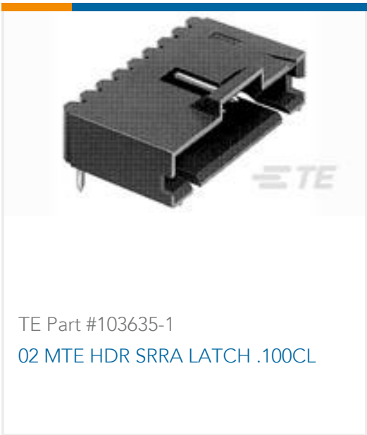
TE Part #103635-1 02 MTE HDR SRRA LATCH .100CL