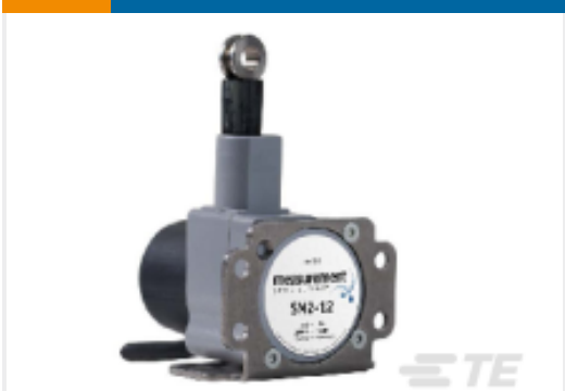
TE Part #SM2-25 STRING POT, 25 INCH RANGE