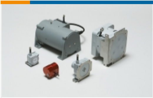
Cable Actuated Position Sensors(24)