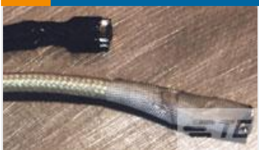
TE Part #3821734002 RT555-3/4-0-SP