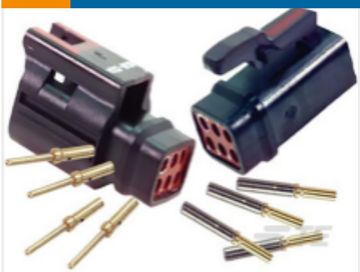
TE Part #ASC105-06SN RECEPT.AS MODULAR. SKT.