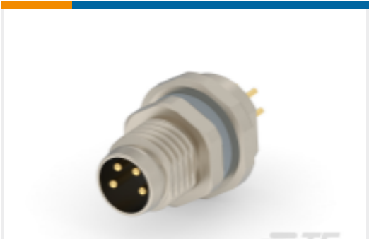
TE Part #T4040014041-000 M8.MLE.PNLREAR.4POS.STR PCB