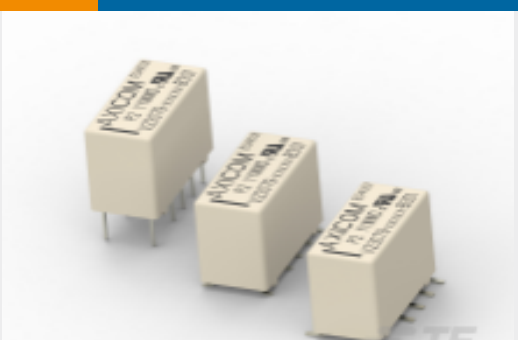
TE Part #7-1393788-0 Small Signal Relay, Axicom P2 Standard