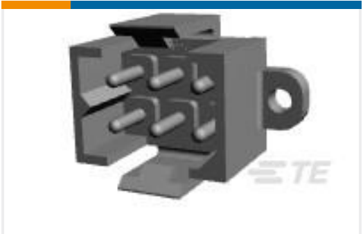
TE Part #1-207158-0 METRIMATE PIN HDR ASY,6P LF