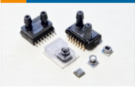
Board Mount Pressure Sensors(24)