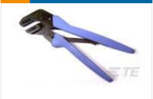
TE Part #90547-1 ASSY PRO-CRIMPER UNIV M-N-L