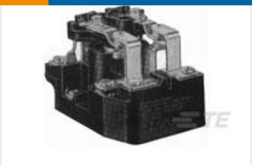
TE Part #8-1393127-6 PRD-3DH0-24=PRD