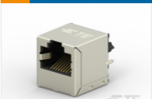
TE Part #5-2301995-1 RJ45 JACK INT.MAG. 1GB 1X1 VERT.