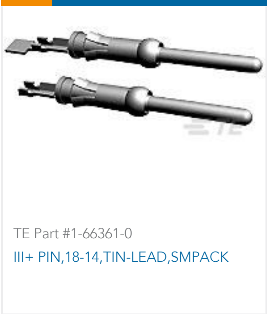
TE Part #1-66361-0 III+ PIN,18-14,TIN-LEAD,SMPACK