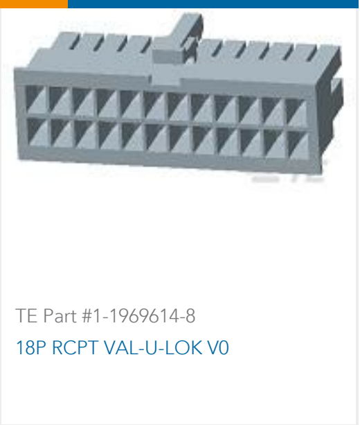
TE Part #1-1969614-8 18P RCPT VAL-U-LOK V0