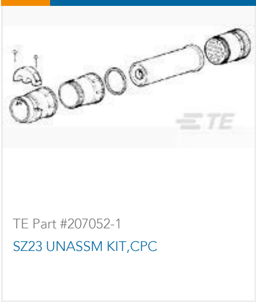
TE Part #207052-1 SZ23 UNASSM KIT,CPC