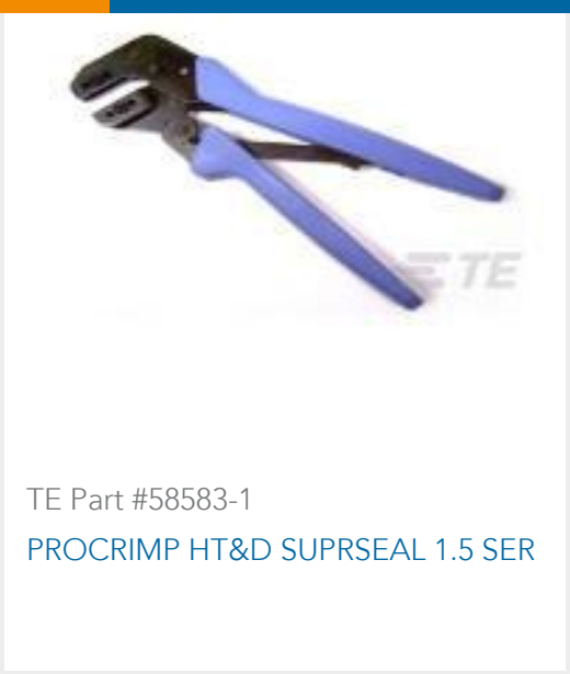
TE Part #58583-1 PROCrimp HT&D SUPRSeal 1.5 Ser