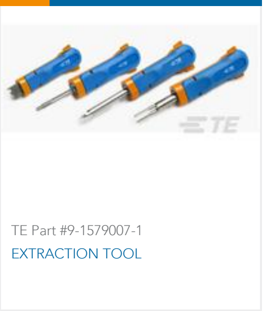
TE Part #9-1579007-1 EXTRACTION TOOL