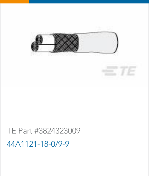
TE Part #3824323009 44A1121-18-0/9-9