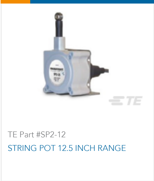
TE Part #SP2-12 STRING POT 12.5 INCH RANGE