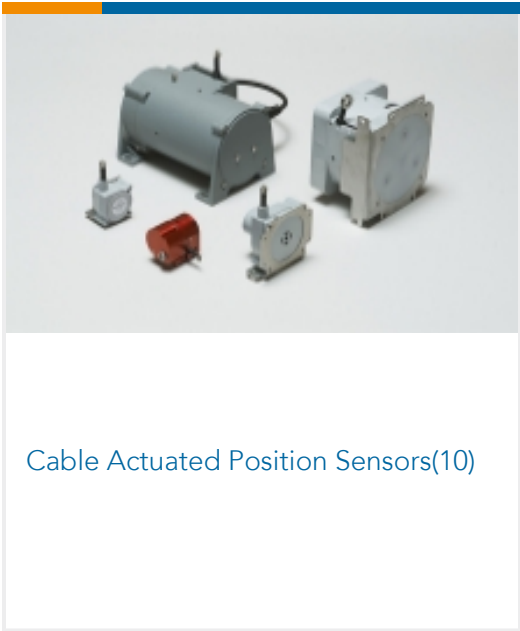
Cable Actuated Position Sensors(10)