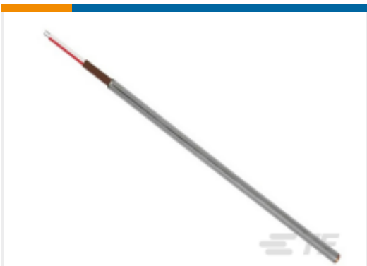
TE Part #R-10318-69 TC,BRG,IS,T,STD,U,.188D