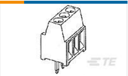
TE Part #1-282834-1 TERMI-BLOK PCB MOUNT, 90 11P.