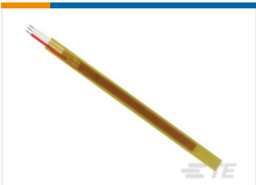
TE Part #R-8204 RTD,STRR,P100,385,.5%,.030T,H