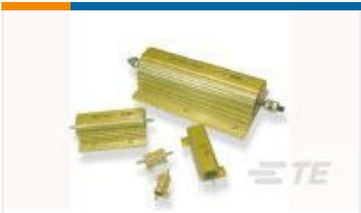
TE Part #2-1676625-4 HSA25 34R 5%