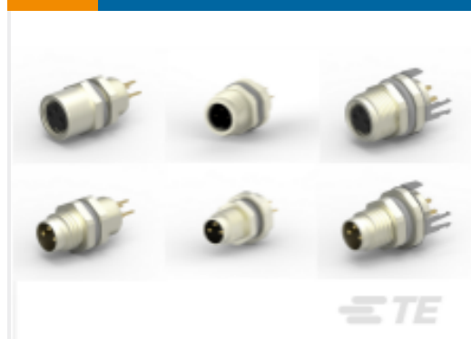
TE Part #T4040034041-000 M8 Panel Mount PCB