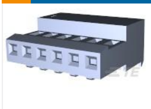
TE Part #3-641192-6 06P MTA100 CONN ASSY BLU LF