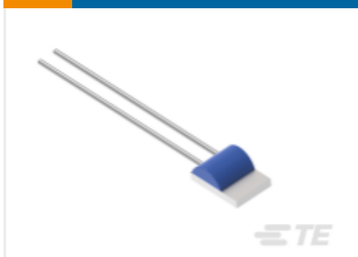
TE Part #NB-PTCO-006 Pt1000, 2.0x2.3, Class B, PTFC102B1G0