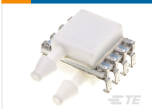
TE Part #4525-DS5A002GP PRESS XDCR, ANALOG, PSI RANGE