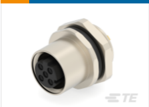
TE Part #T4133512041-000 M12,FRONT MOUNT,FEMALE,D,4P, SOLDER WIRE