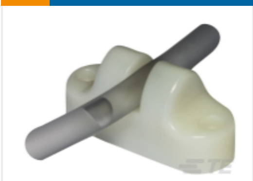
TE Part #10217758-00 ABD,AD-101,COMPACT ASSY,6MM