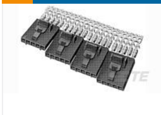
TE Part #5-103960-5 4X6 MTE RCPT SR LATCH .100CL