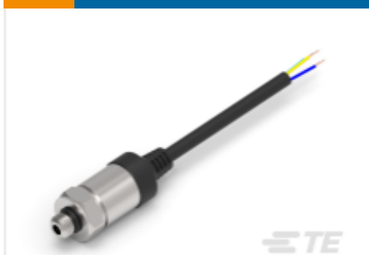
TE Part #20014203-08 PRESS XDCR M323M-000004-070BG