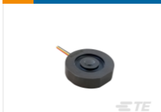
TE Part #20009605-02 Compact Compression Load Cell