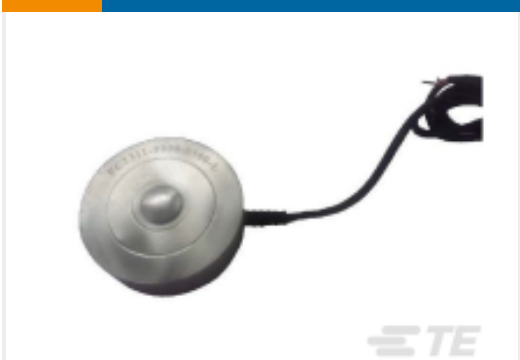
TE Part #FC2311-0000-0250-L COMPRESSION LOAD CELL - 100MV / 0.5-4.5V