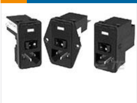
TE Part #3-6609106-0 PS0S0DHXB=C1178