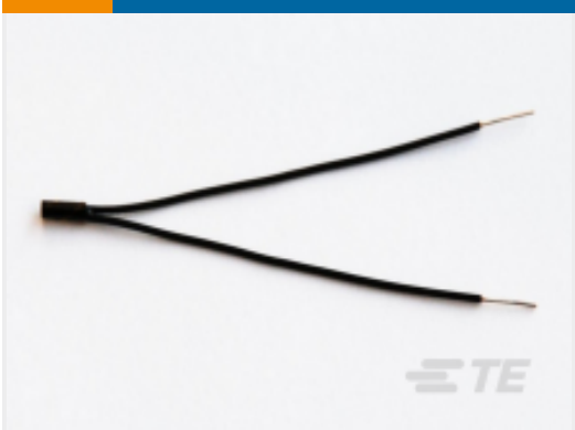
TE Part #GA10K3MBD1 MBD9-PROBE