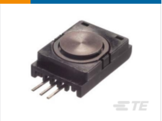
TE Part #20015885-02 Compression Load Cell - 0.5-4.5V