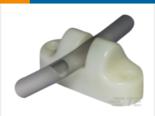
TE Part #10217784-00 ABD,AD-101, COMPACT ASSY, 4MM