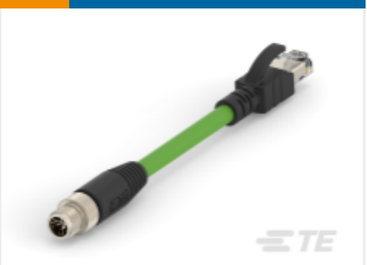
TE Part #TCX38725102-004 RPC-M12X-8MS-3.0SH-RJ45-8MS-PUR