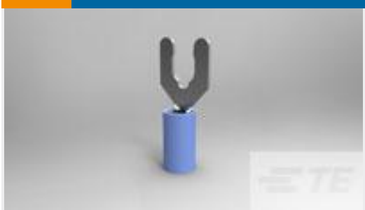
TE Part #52937-1 TERMINAL,PIDG SPR SPD 16-14 10