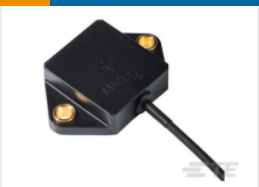
TE Part #G-NSDOG2-200 AXISENSE-2 CAN J1939-90 TILT SENSOR F MT