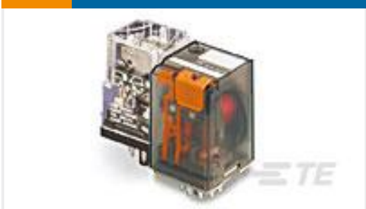
TE Part #3-1393104-8 KRPA-11AY-240=KRPA