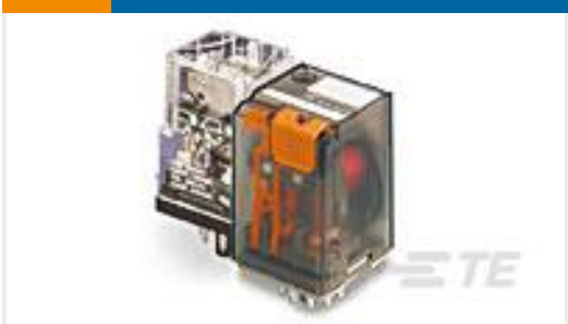
TE Part #4-1393104-6 KRPA-11DG-48=KRPA