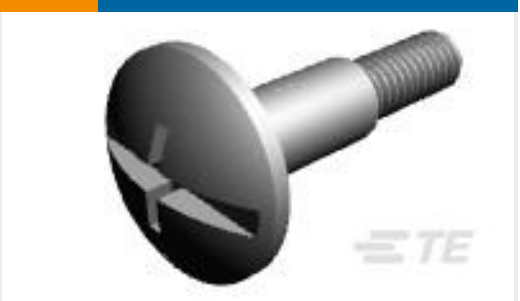
TE Part #208211-4 SCREW,SHOULDER,SPECIAL