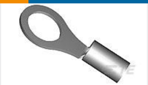
TE Part #321165 TERMINAL,SOLIS R 16-14HD 1/2