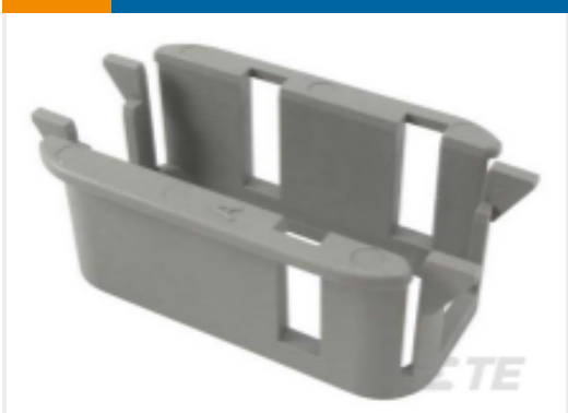
TE Part #1011-052-1205 SEAL RET, 12P, GRY, DTM, A