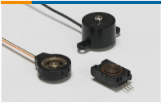
Force Sensor Elements(25)