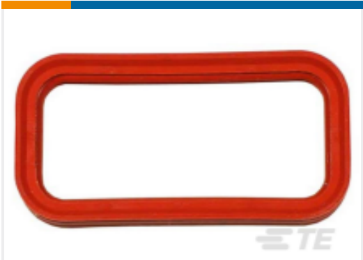
TE Part #1010-042-1206 SEAL, INTF, 12P, RED-ORG, DTM