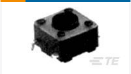
TE Part #4-1437565-1 FSM4JSMA=SMT,TACTILE,PB SWITCH