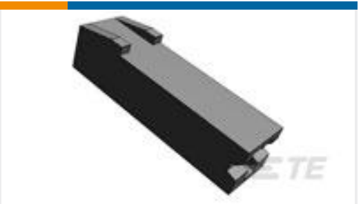
TE Part #926410-1 110 FASTON HSG. REC. 1P CLEAR