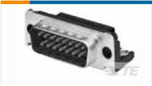
TE Part #5788794-1 25 HTMSFL PLUG RA 318 (IN,BL)