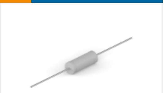
TE Part #9-2176412-0 5W XSM M/OX 5% 27K

ENG_CVM_CVM_86BSD030PG-3AIC_B.2d_dxf.zip