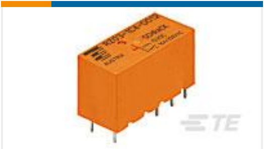
TE Part #7-1415899-7 RZ03-1C4-D012-R