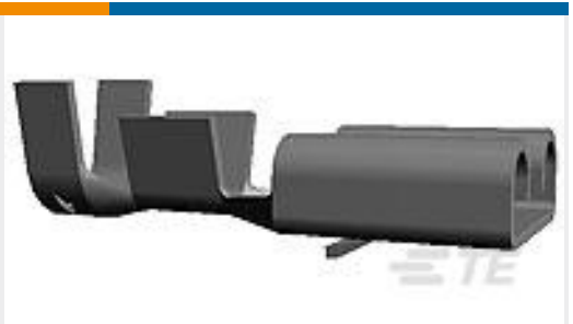
TE Part #60838-1 FF 250 REC 22-18AWG TPBR LP