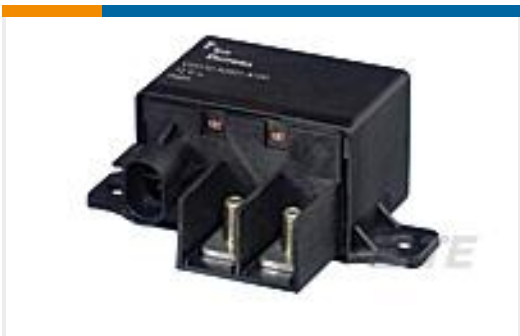
TE Part #9-1415001-5 V23132E2001A200