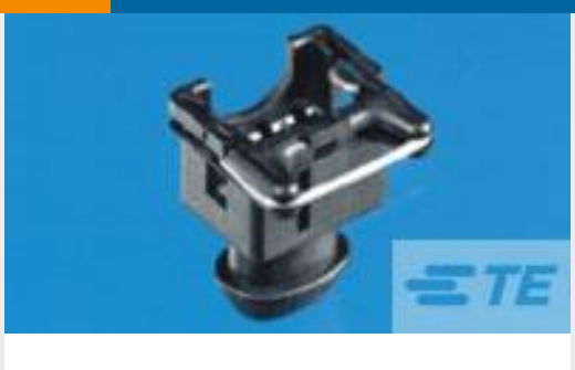
TE Part #827551-3 JUNIOR TIMER CONNECTOR-HSG