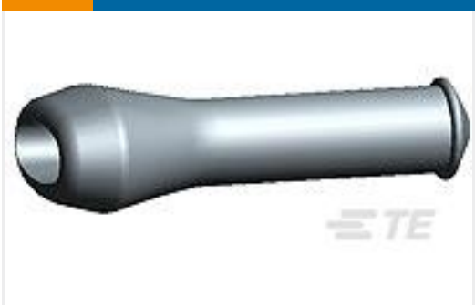
TE Part #880810-1 COVER CAP , 2 WAY