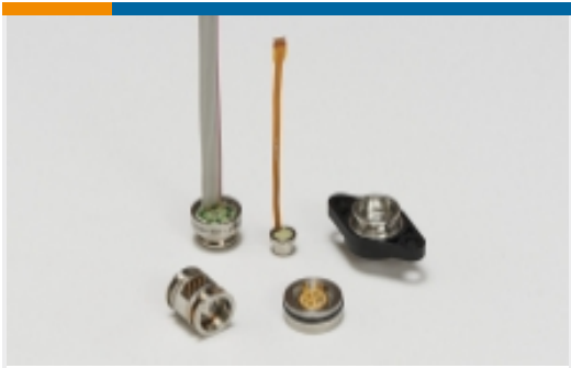
Media Isolated Pressure Sensors(40)