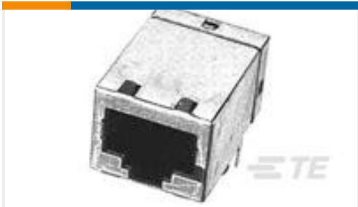
TE Part #100616-2 8/8 MOD.JACK ASSY TE SHIELDED