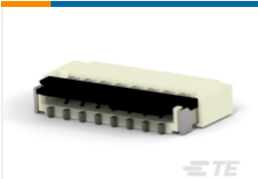
TE Part #1-2328724-5 15PIN 0.3MMP FPC CONNECTOR, FRONT FLIP