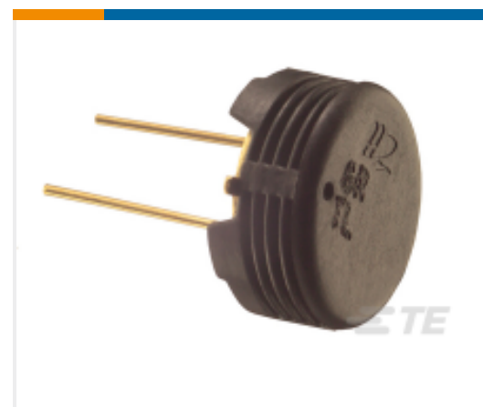
TE Part #HPP801A031 HS1101LF HUMIDITY SENSOR