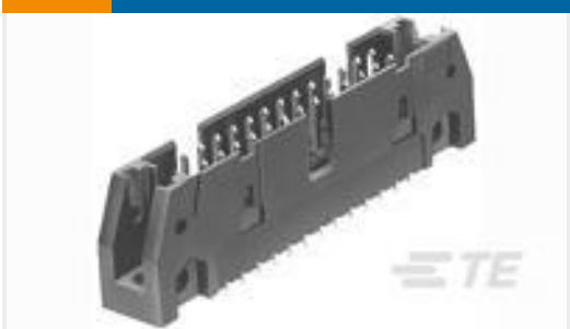
TE Part #102154-4 020 UNIV HDR SP 4S 30DP STD