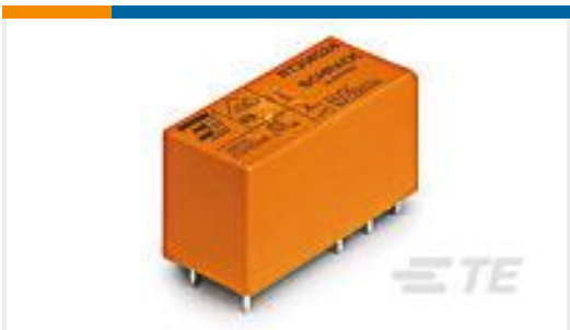
TE Part #6-1393243-8 RT424024