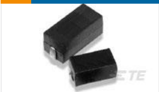
TE Part #5-1676966-3 SMW2 15R 5%