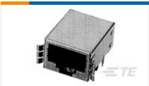
TE Part #1116503-2 MJ,10MM,8P,SHLD,NOPNL TABS,SN