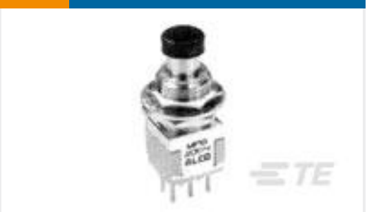
TE Part #5-1437567-3 MPG206R=(MSPG) SW PUSHBUTTON