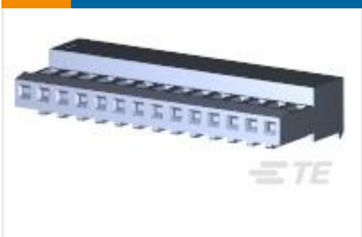
TE Part #4-640440-4 14P MTA100 CONN ASSY 22AWG RED