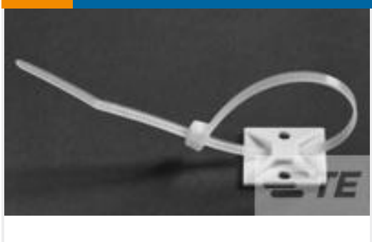
TE Part #608803-1 CABLE TIE MOUNT, 4-WAY,1-1/8"