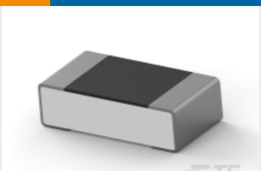
TE Part #3-2176369-5 RQ 0603 90R9 0.1% 10PPM 5K RL