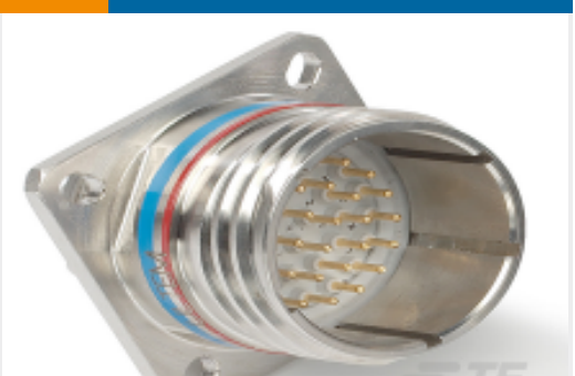
TE Part #YDTS20W09-35PNV001 RECP ASSY