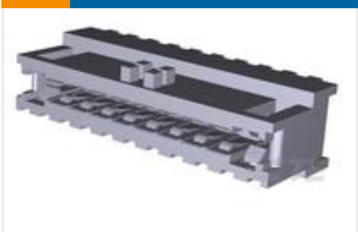
TE Part #1-1355181-8 DUOPLUG2,5GEH 8P 6X

Datasheets & Catalog Pages TESS-ANDO-408-0000073