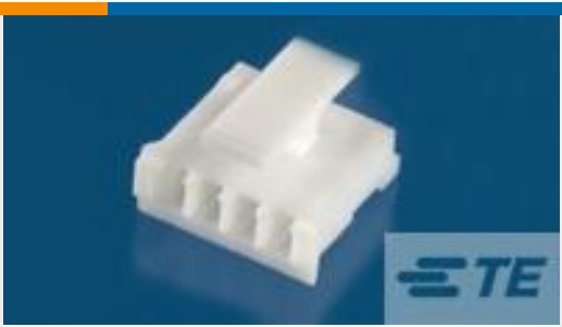
TE Part #1735447-4 HPI 2.0 RECEPTACLE HOUSING, 4P