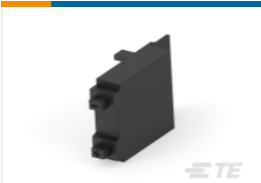
TE Part #3-1437603-8 DPS9131AK=1-2-4-8 BCD CODE