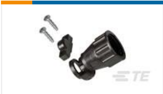
TE Part #1-206062-6 CABLE CLAMP KIT #11