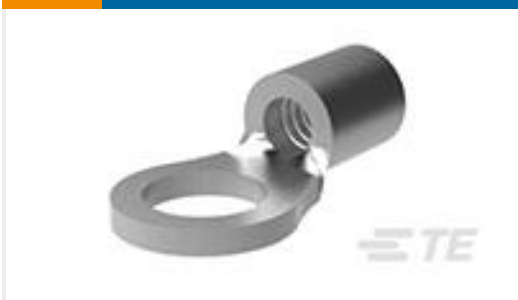
TE Part #2-34123-1 TERMINAL,SOLIS R 16-14 10