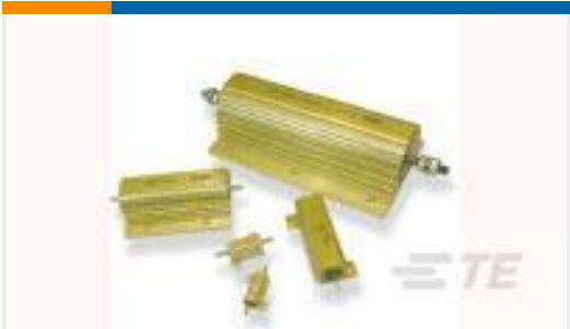
TE Part #5-1625999-4 HSC100 R50 5%