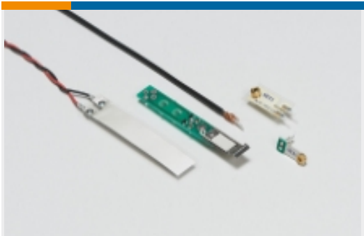
Piezo Film Sensors(3)