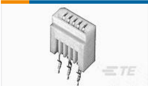
TE Part #1-84984-2 1mm FFC DIP V ASSY 12P TUBE