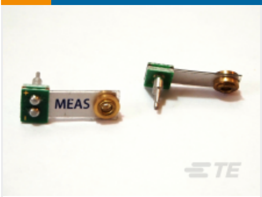
TE Part # CAT-PFS0011 High Sensitivity Vibration Sensor

numbers that TE has identified as EU ELV compliant have a maximum concentration of 0.1% by weight in homogenous materials for lead, hexavalent chromium, and mercury, and 0.01% for cadmium, or qualify for an exemption to these limits as defined in the Annexes of Directive 2000/53/EC (ELV). Regarding the REACH Regulation, the information TE provides on SVHC in articles for this part number is based on the latest European Chemicals Agency (ECHA) ‘Guidance on requirements for substances in articles’ posted at this URL: https://echa.europa.eu/guidance-documents/guidance-on-reach