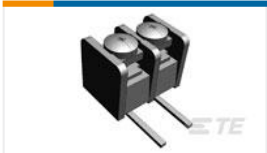
TE Part #7-1437667-1 4DB-R108-02=4DB ASSEMBLY