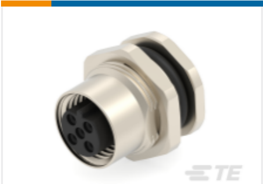
TE Part #T4131412041-000 M12,REAR MOUNT,FEMALE,B,4P, SOLDER WIRE