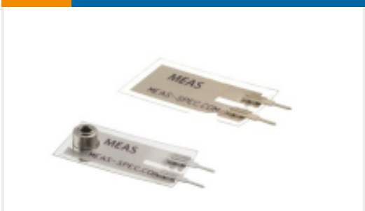
TE Part #11028362-00 LDT0-028K W/SOLDER TAB CLEAR