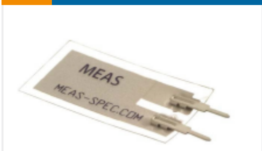
TE Part #11026275-00 DT1-028K N/TH N/HOLE