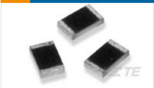
TE Part #5-1879264-8 RP 2B 100K 0.1% 15PPM CUT LENGTH