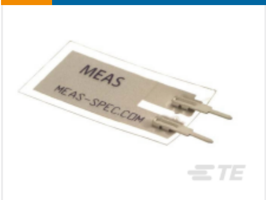
TE Part # 11026275-00 DT1-028K N/TH N/HOLE