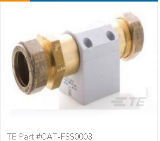
TE Part #CAT-FSS0003 22MM COMPRESSION WATER FLOW SWITCH