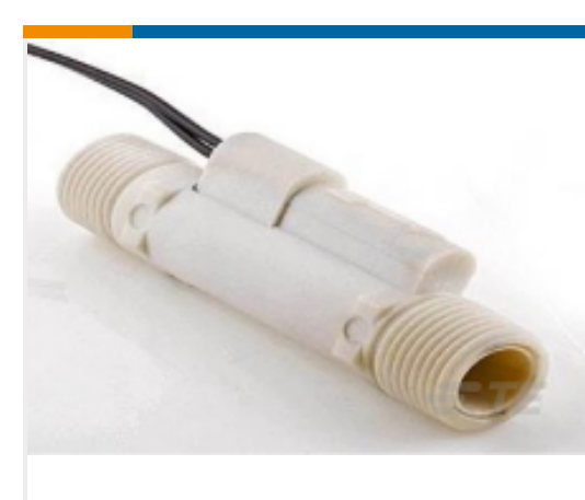
TE Part #CAT-FSS0012 Fuel/Oil Flow Switch, Male, 3/8 BSP