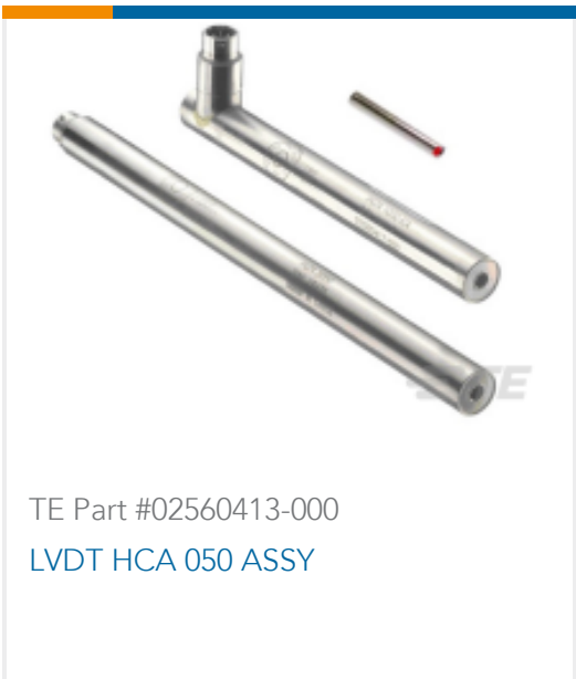
TE Part #02560413-000 LVDT HCA 050 ASSY