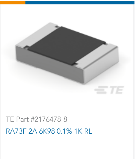
TE Part #2176478-8 RA73F 2A 6K98 0.1% 1K RL

Datasheets & Catalog Pages Miniature General Purpose AC LVDT English