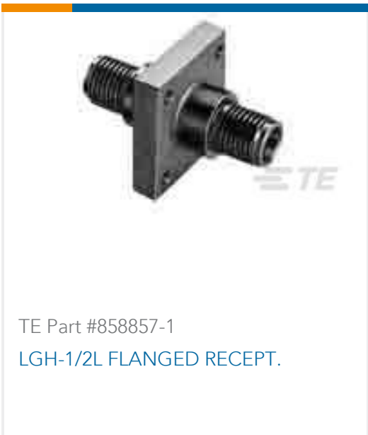
TE Part #858857-1 LGH-1/2L FLANGED RECEPT.