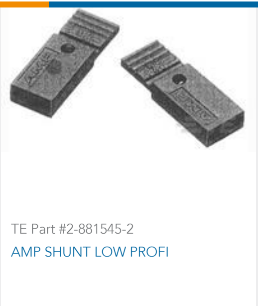
TE Part #2-881545-2 AMP SHUNT LOW PROFI