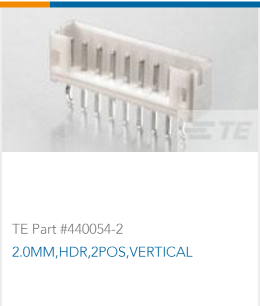
TE Part #440054-2 2.0MM,HDR,2POS,VERTICAL