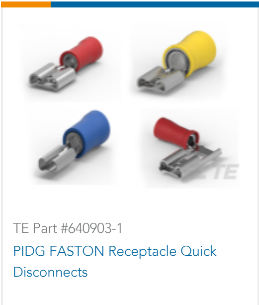
TE Part #640903-1 PIDG FASTON Receptacle Quick Disconnects