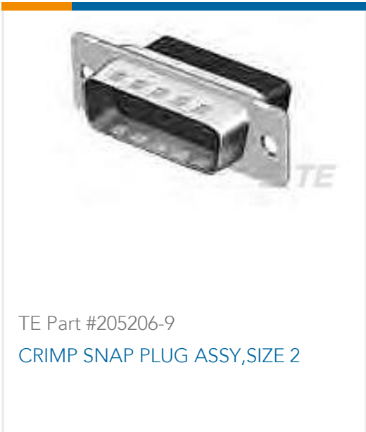
TE Part #205206-9 CRIMP SNAP PLUG ASSY,SIZE 2