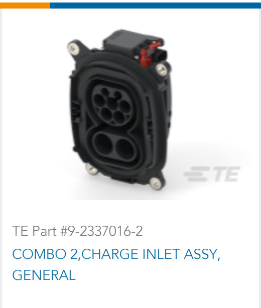
TE Part #9-2337016-2 COMBO 2,CHARGE INLET ASSY, GENERAL