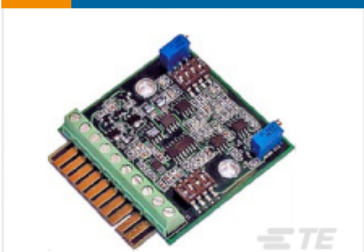
TE Part #04171776-000 LVM-110 AMP/DEMOD BD ASSY