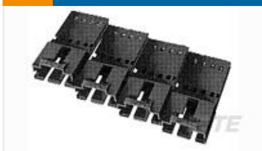
TE Part #103653-1 02 MTE SHRD PIN HSG SR LATCH