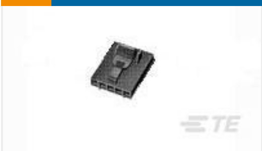
TE Part #104257-3 04 MTE RCPT HSG SR LATCH .100