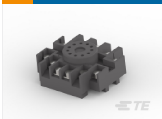
TE Part #2-1419106-4 27E892=SOCKET,KRPA,11,OCTAL,PO