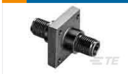
TE Part #858857-1 LGH-1/2L FLANGED RECEPT.