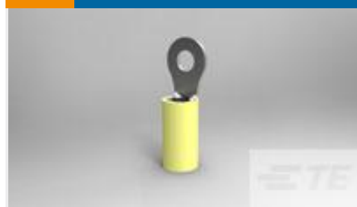
TE Part #321021 PIDG RING (26-22)