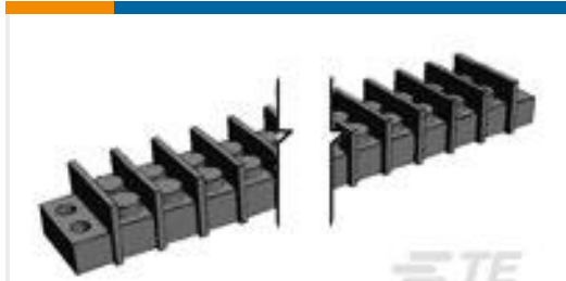
TE Part #1-1546306-2 12P.374" DR BARRIER STRIP

Datasheets & Catalog Pages Miniature General Purpose AC LVDT English