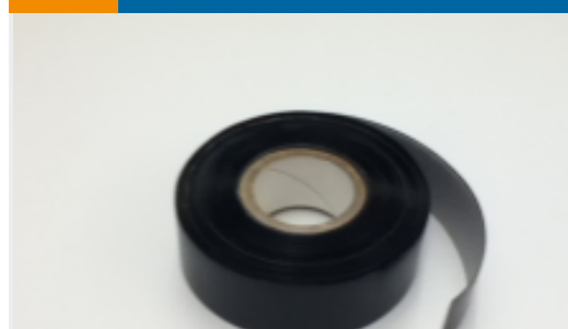
TE Part #890901-006 S1030

Datasheets & Catalog Pages Miniature General Purpose AC LVDT English