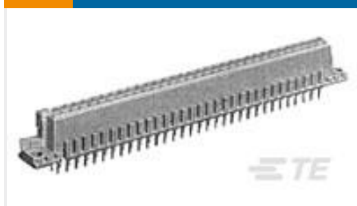
TE Part #5650861-5 ASSEMBLY,RECEPTACLE,EUROCARD, T