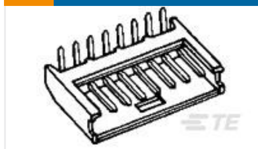
TE Part #280379-2 6P MODU II SHRD HDR, RT ANG, 0.38 AU