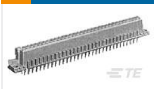
TE Part #5650858-5 ASSEMBLY,RECEPTACLE,EUROCARD, T