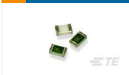
TE Part #6-1614884-0 CPF 0805 820R 0.1% 25PPM 1K RL