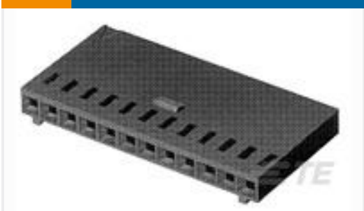
TE Part #280360 AMPMODU II REC. HSG, SINGLE ROW 6 POS