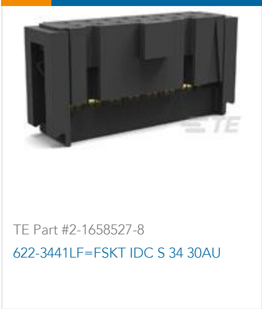
TE Part #2-1658527-8 622-3441LF=FSKT IDC S 34 30AU