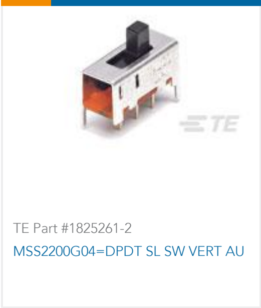
TE Part #1825261-2 MSS2200G04=DPDT SL SW VERT AU