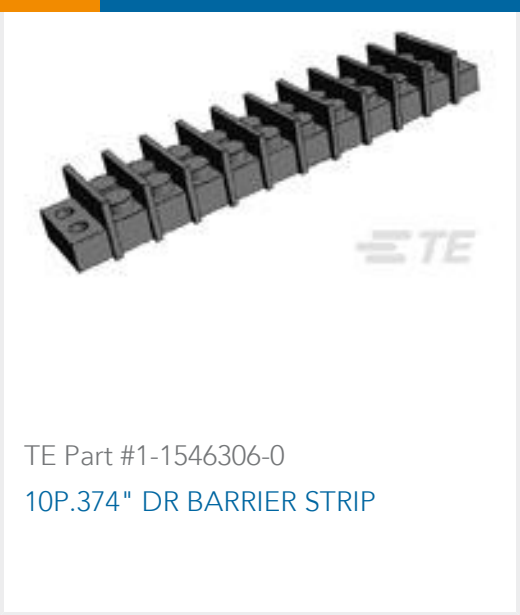
TE Part #1-1546306-0 10P.374" DR BARRIER STRIP