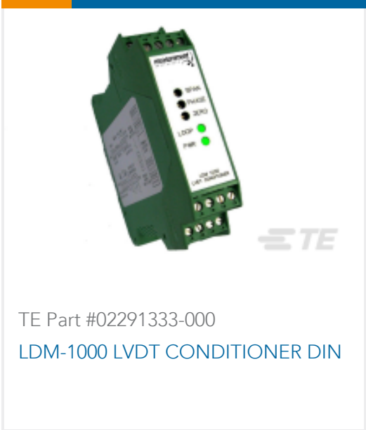
TE Part #02291333-000 LDM-1000 LVDT CONDITIONER DIN