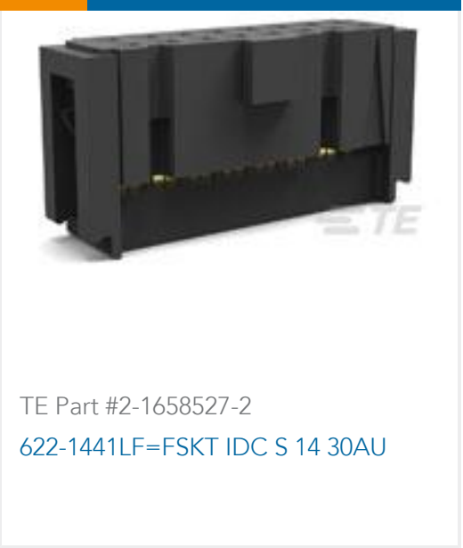
TE Part #2-1658527-2 622-1441LF=FSKT IDC S 14 30AU