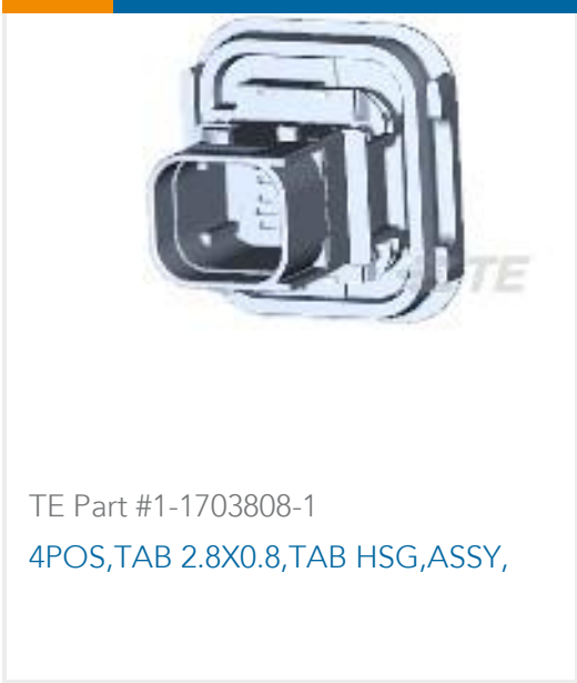
TE Part #1-1703808-1 4POS,TAB 2.8X0.8,TAB HSG,ASSY,