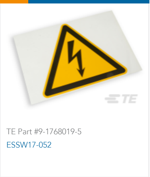
TE Part #9-1768019-5 ESSW17-052