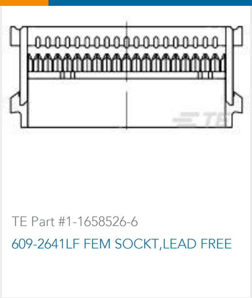
TE Part #1-1658526-6 609-2641LF FEM SOCKET,LEAD FREE