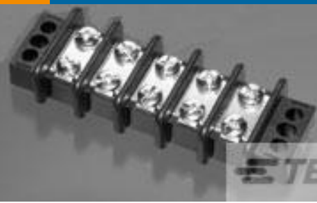
TE Part #1546310-8 8P .563" DR BARRIER STRIP