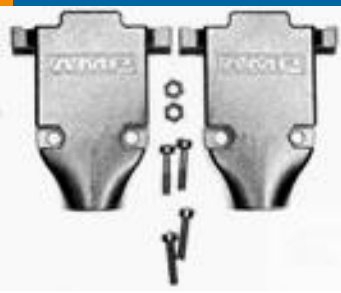
TE Part #5748677-2 PLTD PLST CBL CLMP KIT, SZ 2