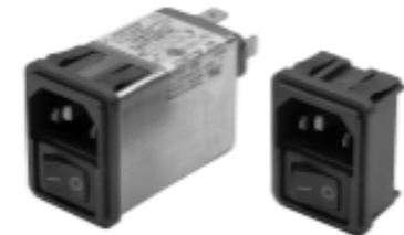
TE Part #1-1609112-4 IEC Unfiltered Inlets, Corcom C Series