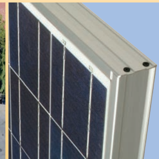
Improved Frame Technology