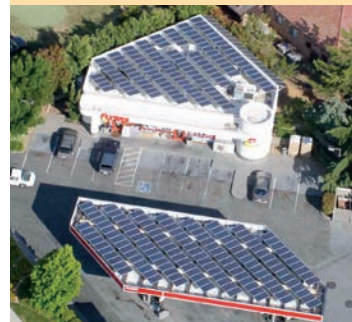
Sharp multi-purpose modules offer industry-leading performance for a variety of applications.

This module uses an advanced surface texturing process to increase light absorption and improve efficiency.