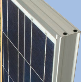
Improved Frame Technology