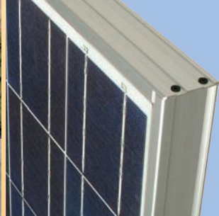
Improved Frame Technology