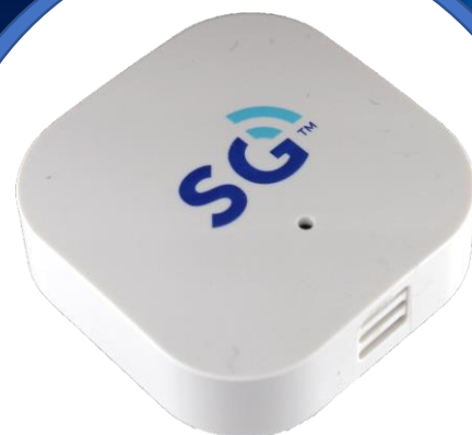
SGW8130 BLE Sensor Tag