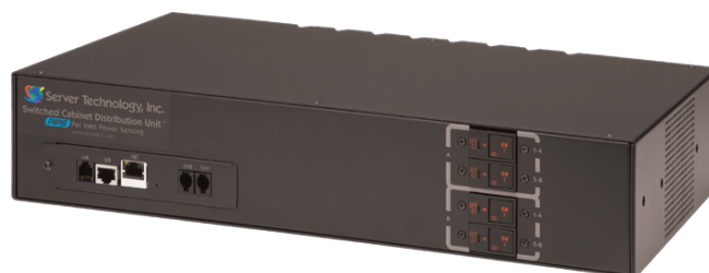
Rear View: Circuit Breakers, Network, serial, linking, and environmental inputs