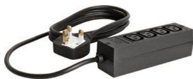
with UK power supply cord