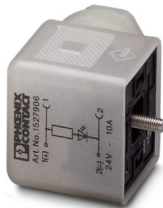
Valve connector, Universal, 3-position, Valve connector A, Screw connection, cable gland Pg9, external cable diameter 6 mm ... 8 mm

Please be informed that the data shown in this PDF document is generated from our online catalog. Please find the complete data in the user documentation. Our general terms of use for downloads are valid.