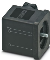
Valve connectors, Universal, 3-position, Valve connector A, Screw connection, cable gland M16, external cable diameter 6 mm ... 8 mm

Please be informed that the data shown in this PDF document is generated from our online catalog. Please find the complete data in the user documentation. Our general terms of use for downloads are valid.