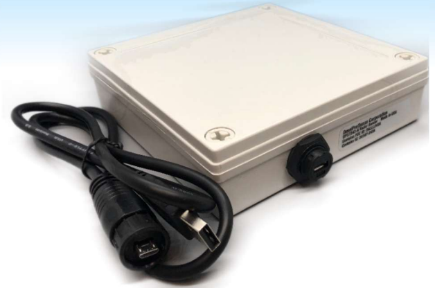
OPS7243 Radar Sensor