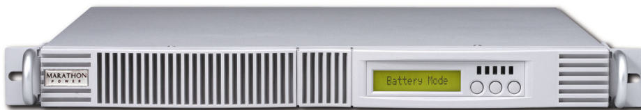
1U & 2U Rack-Tower Models