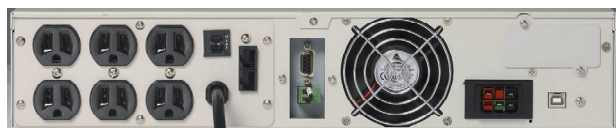
Vault RT Rear (2U) 700 - 3000VA