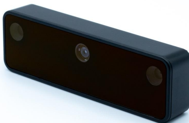
Figure 1 - OAK-D Lite