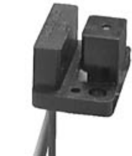
Representative photograph, actual product appearance may vary.

Due to regional agency approval requirements, some products may not be available in your area. Please contact your regional Honeywell office regarding your product of choice.