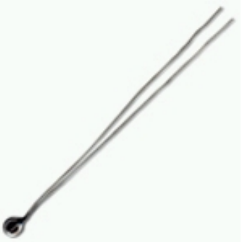
Actual product appearance may vary.