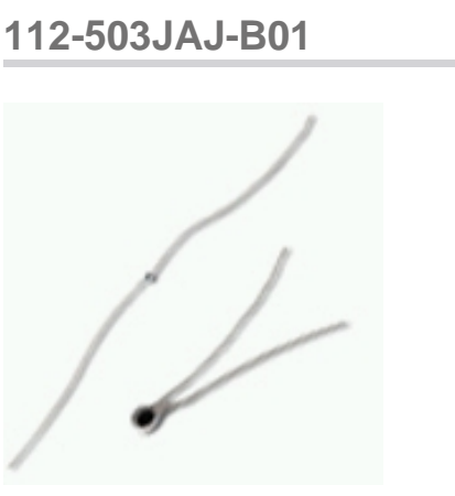
Actual product appearance may vary.