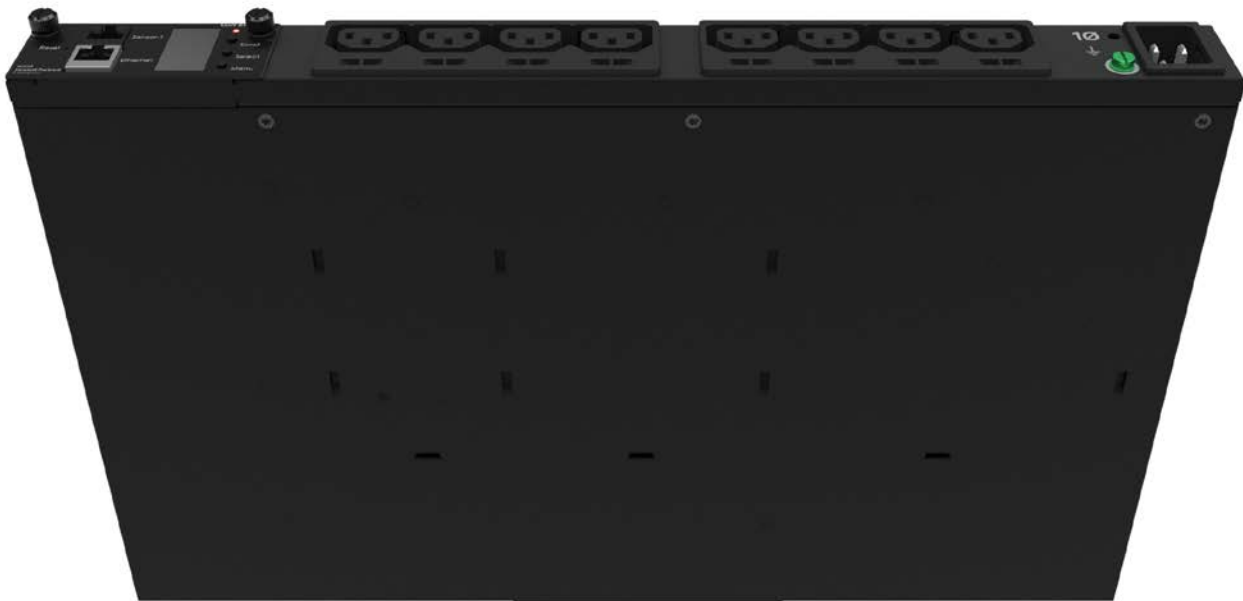
1U Horizontal 120V Model (P9R45A)