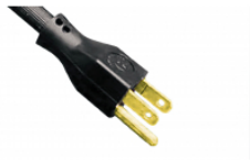
5-15P Straight Blade