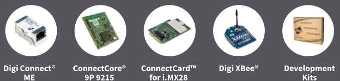
Digi Connect® ME