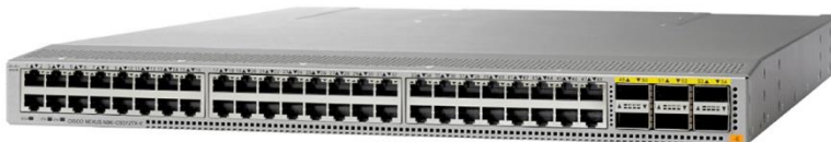
Figure 3. Cisco Nexus 9372TX-E Switch

The Cisco Nexus 9396PX Switch is a 2RU switch that supports 1.92 Tbps of bandwidth and over 1500 mpps across 48 fixed 10-Gbps SFP+ ports and an uplink module (see Figures 10 and 11 later in this document) that can support up to 12 fixed 40-Gbps QSFP+ ports (Figure 4).