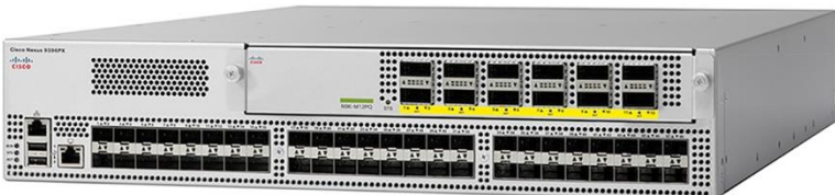
Figure 4. Cisco Nexus 9396PX Switch

The Cisco Nexus 9396TX Switch is a 2RU switch that supports up to 1.92 Tbps of bandwidth and over 1500 mpps across 48 fixed 100M/1/10GBASE-T ports and an uplink module (see Figures 9 and 10 later in this document) that can support up to 12 fixed 40-Gbps QSFP+ ports (Figure 5).