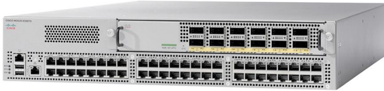
Figure 5. Cisco Nexus 9396TX Switch

The Cisco Nexus 93128TX Switch is a 3RU switch that supports 2.56 Tbps and over 750 mpps across 96 fixed 100M/1/10GBASE-T ports and an uplink module (see Figures 9 and 10 later in this document) that can support up to 8 fixed 40-Gbps QSFP ports (Figure 6).