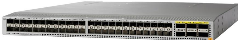
Figure 2. Cisco Nexus 9372PX-E Switch

The Cisco Nexus 9372TX Switch is a 1RU switch that supports 1.44 Tbps of bandwidth and over 1150 mpps across 48 fixed 100M/1/10-Gbps BASE-T ports and 6 fixed 40-Gbps QSFP+ ports. The Cisco Nexus 9372TX-E Switch (Figure 3) is a minor hardware revision of the Cisco Nexus 9372TX. Enhancements include hardware capability for IP-based EPG classification in Cisco ACI mode.