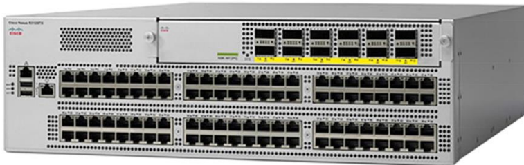
Figure 6. Cisco Nexus 93128TX Switch

The Cisco Nexus 93120TX Switch is a 2RU switch that supports 2.4 Tbps and over 750 mpps across 96 fixed 100M/1/10GBASE-T ports and 6 fixed 40-Gbps QSFP ports (Figure 7).