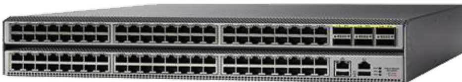
Figure 7. Cisco Nexus 93120TX Switch

The 40-Gbps ports for the Cisco Nexus 9396PX, 9396TX, and 93128TX are provided on an uplink module that can be serviced and replaced by the user. Three uplinks modules are available for Cisco Nexus 9300 platform leaf switches for Cisco ACI.