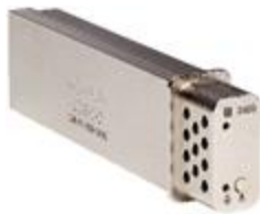
Figure 11. 240G SSD storage

Figures 11 and 12 show some of the available accessories.