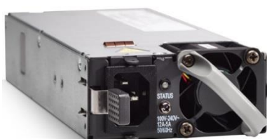
Figure 13. 650W AC power supply