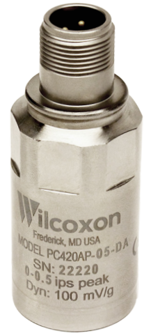
Table 1: PC420Ax-yy-DA dual output model selection guide

Wilcoxon's 4-20 mA vibration sensors integrate easily with an existing PLC, DCS or SCADA system. The PC420A-DA series dual output sensors provide 24/7 monitoring of overall machine vibration for continuous trending, alerting users to changing machine conditions and helping to guide maintenance in prioritizing the need for service. The choice of true RMS, true peak or peak output allows you to choose the sensor that best fits your industrial requirements. The sensor's 4-20 mA output is proportional to acceleration vibration. The dynamic output signal is derived from an internal buffered amplifier and requires that the 4-20 mA loop be powered.